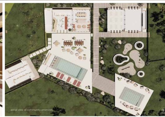
aerial view of community amenities

Guests will enjoy a rewarding resort like paradise