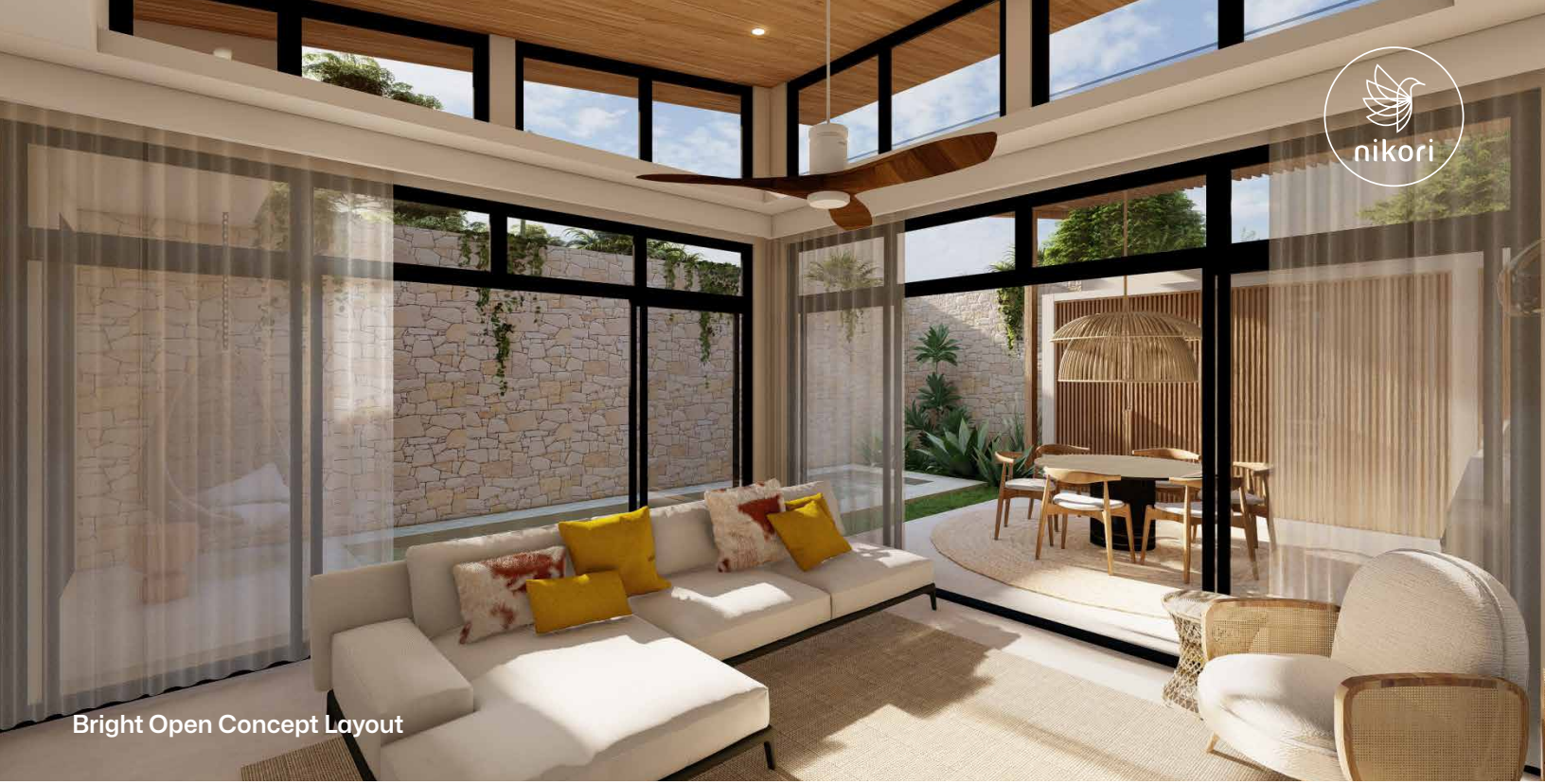
Bright Open Concept Layout