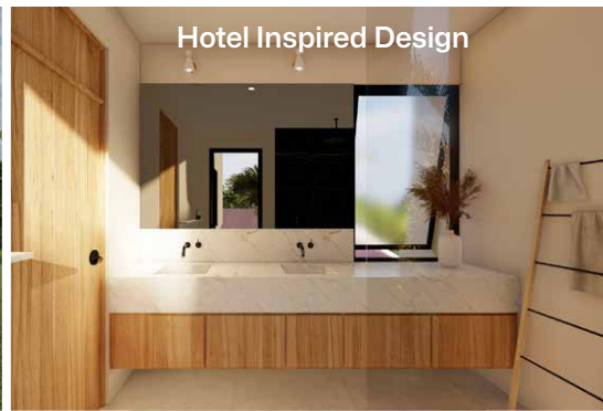
Hotel Inspired Design