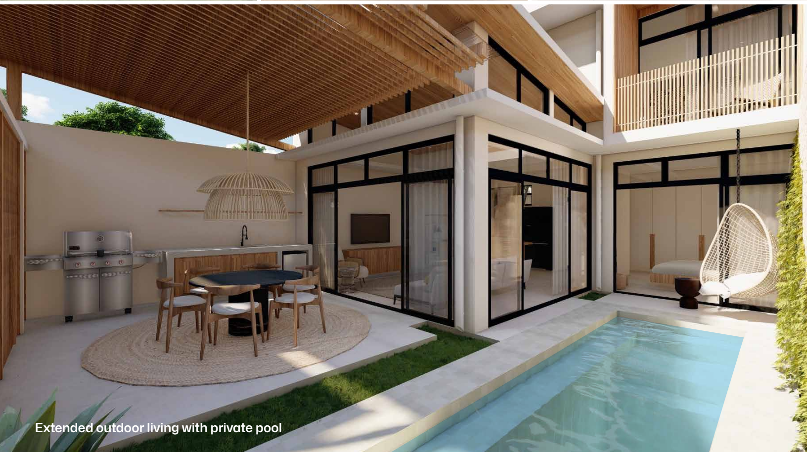
Extended outdoor living with private pool